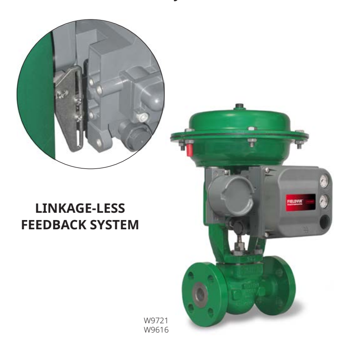
Figure 1. Linkage-Less Non-Contact Feedback System

■ Easy Maintenance — The DVC6200 is modular in design. Critical working components can be replaced without removing field wiring or pneumatic tubing.